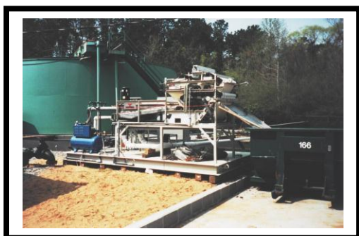
LC Skid Mounted

PHOENIX Process Equipment Co. offers a series of affordable compact belt filter presses and gravity belt thickeners specifically designed for smaller municipal wastewater plants.